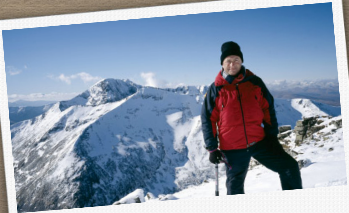
Ben Nevis from Aonach Mor

F or the last 18 months, Alan Titchmarsh has been quietly cultivating a secret love affair ... but it won't be a secret much longer. The wholesome family man has been spotted at locations across the country, cheeks flushed, eyes moist with emotion, caught (as one of his steamy novels might have it) in the crossbeams of passion. He describes his new love as "achingly beautiful", "awe-inspiring" and "full of surprises". But, he readily admits, she's no spring chicken: in fact, she's three billion years old. Alan, you see, has lost his heart to the British Isles.