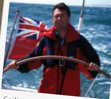
Sailing past the White Cliffs of Dover

"I've watched red squirrels in Lancashire; I've had swallowtail butterflies fluttering around me in Norfolk; and I've climbed the mountain next door to Ben Nevis and looked it in the eye. I've navigated a narrow boat on an aqueduct in Wales hundreds of feet above the ground; descended into the darkness of Gaping Ghyll; and flown over the Hebrides in a jet fighter."