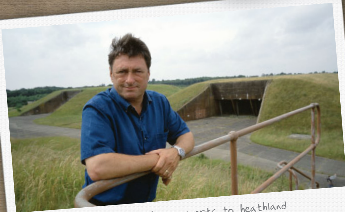
Greenham Common, Berkshire, reverts to heathland

"I've navigated a narrow boat on an aqueduct in Wales hundreds of feet above the ground; descended into the darkness of Gaping Ghyll; and flown over the Hebrides in a jet fighter"