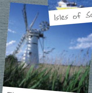
Thurne Dyke Mill, Norfolk