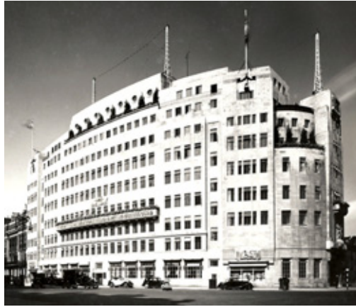
Broadcasting House 1937