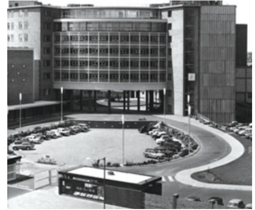
Television Centre 1961